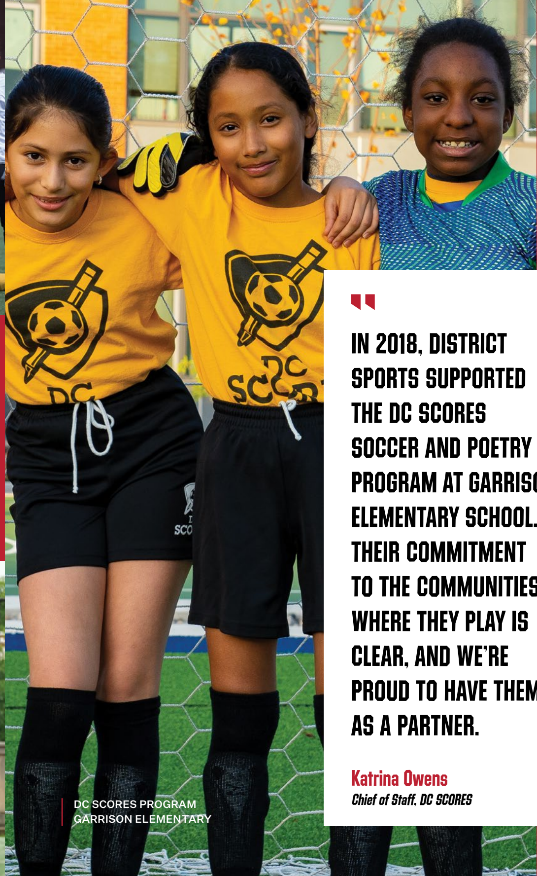
DC SCORES PROGRAM GARRISON ELEMENTARY