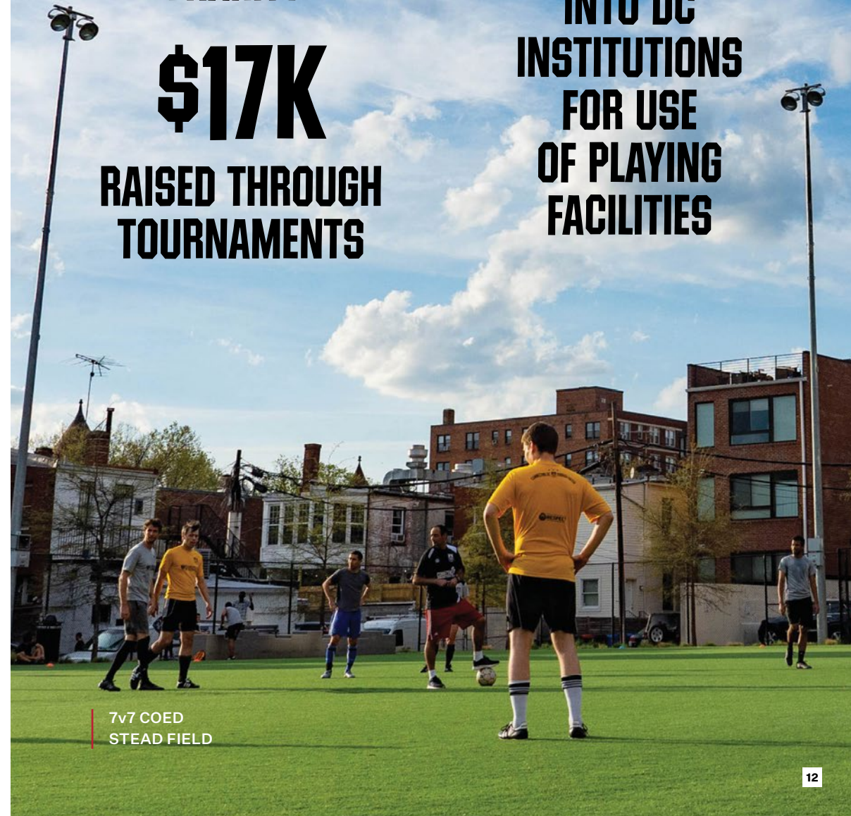
7v7 COED STEAD FIELD

REINVESTED INTO DC INSTITUTIONS FOR USE OF PLAYING FACILITIES