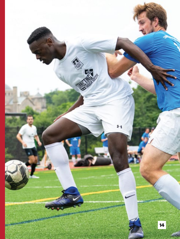
11v11 MEN'S - ST. ALBAN'S SCHOOL

CHERRY BLOSSOM CITY CUP HOY CUP GLOBAL GOALS CUP SUNDRESS SOCCER TOURNAMENT COLUMBIA HEIGHTS CUP D.C. UNITED 5-A-SIDE COPA THINKFOODGROUP