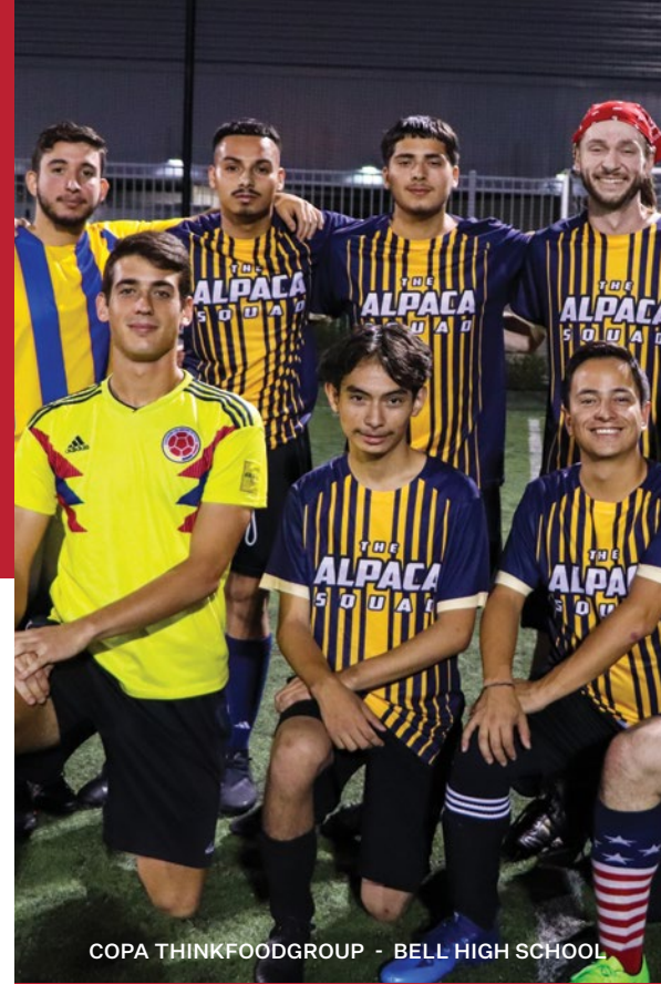
COPA THINKFOODGROUP - BELL HIGH SCHOOL

900 TOTAL PLAYERS ACROSS SEVEN UNIQUE TOURNAMENTS IN 2018