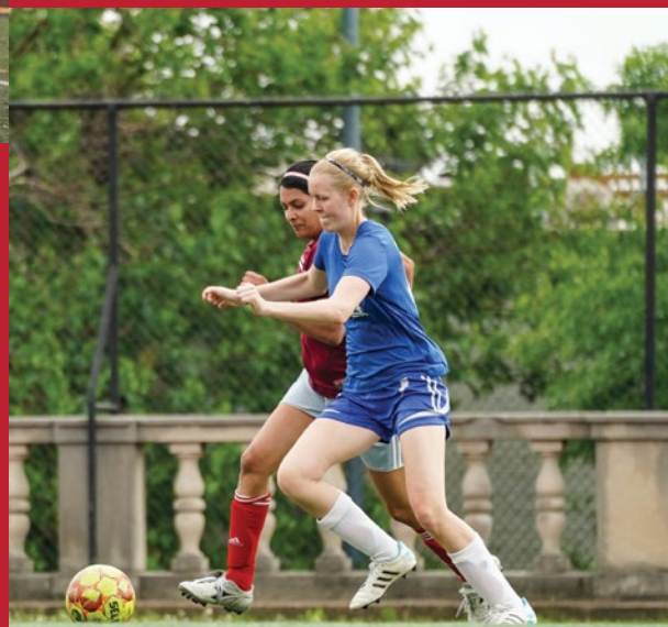
11v11 WOMEN'S - CARDOZO HIGH SCHOOL