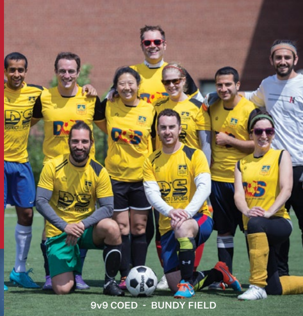
9v9 COED - BUNDY FIELD